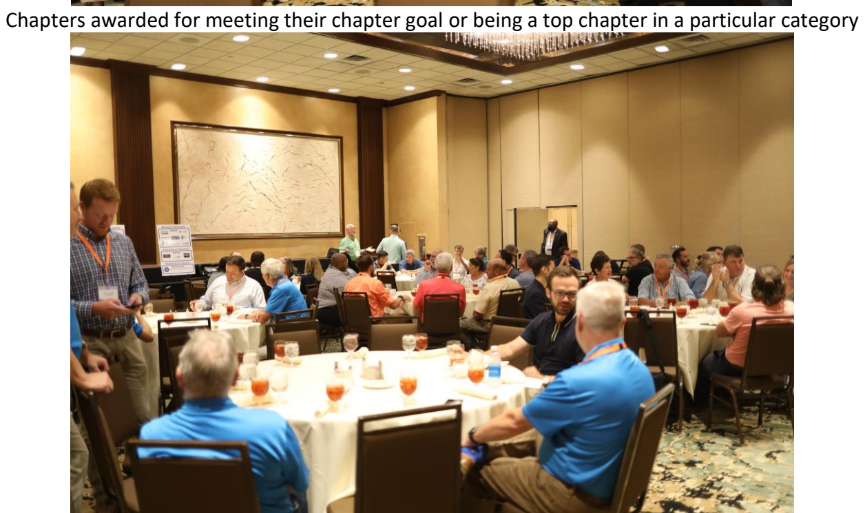
Chapter Members awaiting the Awards Luncheon