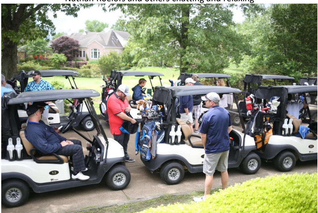
Preparing carts and teams