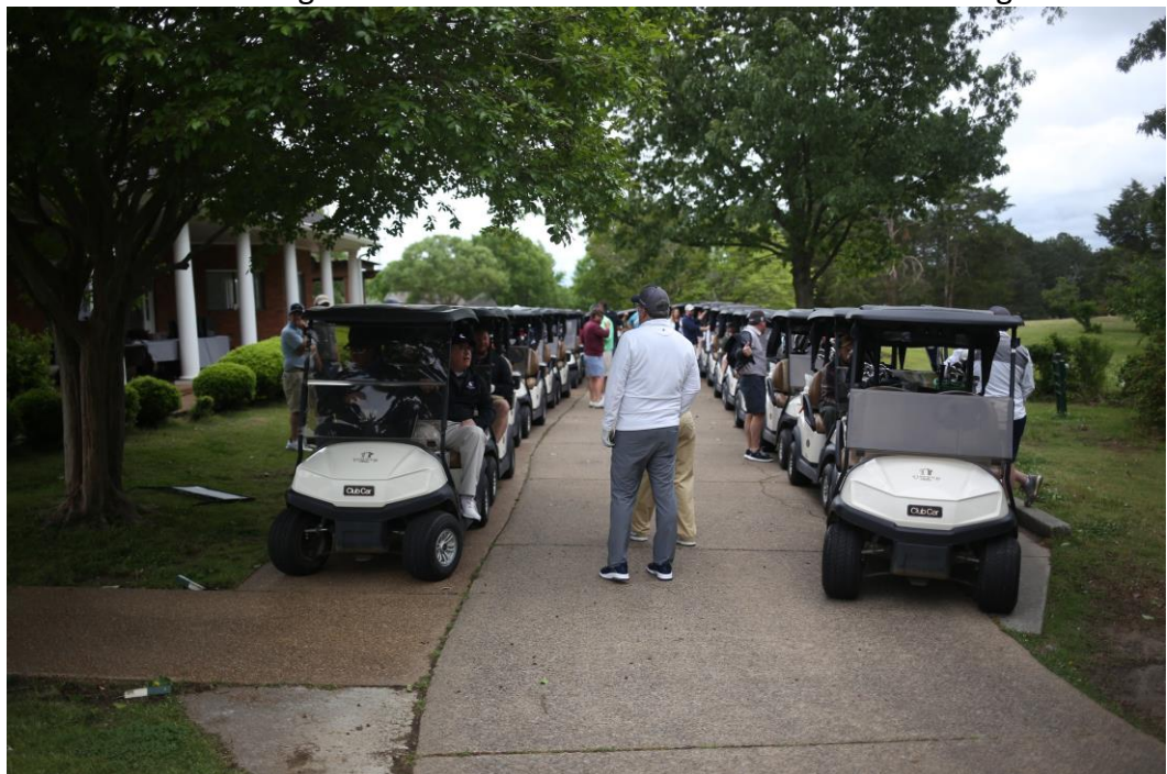
A show of all the teams (carts) who came to support our Chapter